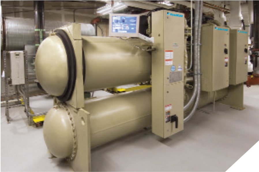
With over 3000 installations worldwide, the Daikin Magnitude is the performance leader in chiller technology.